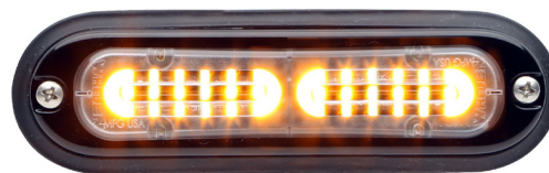
WD TLIA T Series 5.2" Amber $96.99

Prices listed are based on current manufacturers' pricing and may be withdrawn at any time before the stated expiration date of the promotion.