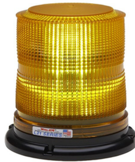
WD L21HAP L21 12V Amber Permanent Mount High Dome $121.00