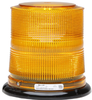
WD L10HAP L10 Amber 12V Permanent Mount High Dome $121.00