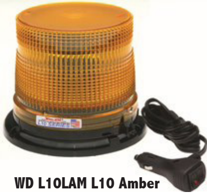
WD L10LAM L10 Amber 12V Magnet Mount Low Dome $110.95