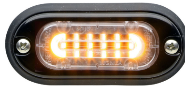
WD TLMIA T Series Mini 3" Amber $86.99