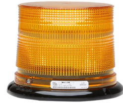
WD L10LAP L10 Amber 12V Permanent Mount Low Dome $95.99